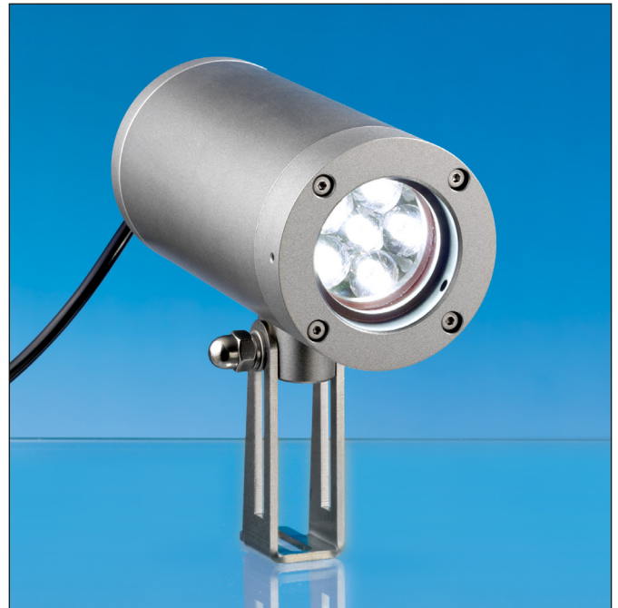
Lumistar luminaire ASL 55-LED-Ex