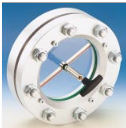
Lumiglas Wiper SW I, fitted into sightglass assembly DIN 28120