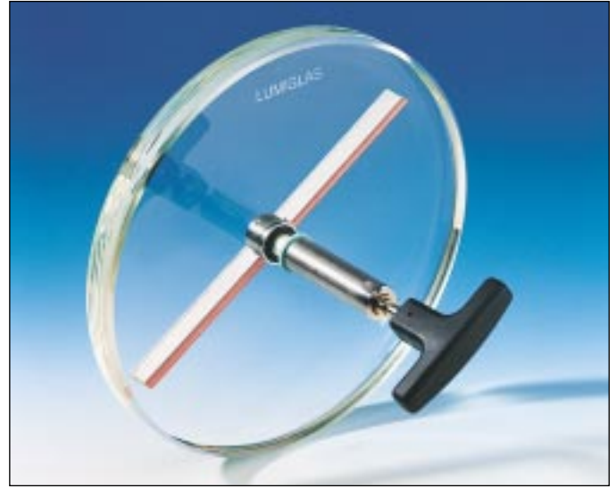
Sightglass Wiper type SW I built into sightglass disc

If the wiper is ordered separately, i.e. not installed into sightglass disc by the manufacturer, the assembly has to be done with regard to separate installation and operating instructions, attached to the delivery.