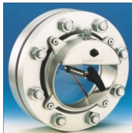
Lumiglas Wiper SW I, as shown adjoining but with Lumistar luminaire fitted.