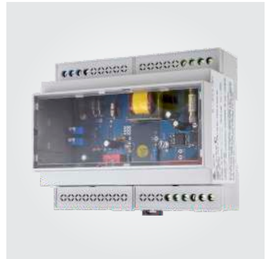
Earth-Rite OMEGA II

Two volt free changeover contacts can be used to switch power to additional ground status indicators or interlock with the process to shutdown product transfer when the OMEGA II detects an open circuit on the path to ground.