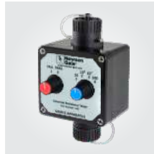
Universal Resistance Tester Product Code: URT.