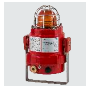
Ex Strobe Light Product Code: STROBE11/A (Amber strobe). Please enquire for options